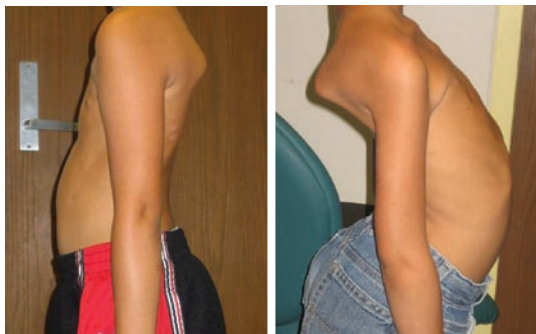
Lordosis occurs due to weakness in the abdominal muscles, particularly the lower abdominals. 3

NOTE: Additional information about the characteristics, prevalence, inheritance, and typical symptom progression in FSHD are available in the publications listed in the “Additional Resources” section.