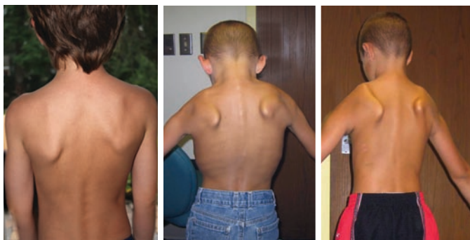
Scapular winging is a common sign of FSHD. Winging can be mild or severe, and is often asymmetrical.

Other features occur in only a small subset of students with FSHD. 4-6 Although these signs and symptoms are less frequent, when present, they can have a large impact on classroom performance.